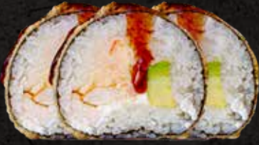
Roll 1 7 pieces

Delicious battered roll filled with kanikama salad, shrimp, avocado and cream cheese. Finished with eel sauce.