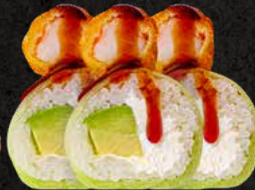
Roll 13 8 pieces

Delicious cucumber-wrapped roll filled with cream cheese and avocado, topped with breaded shrimp and masago dressing. Finished with eel sauce.