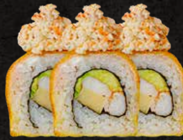
Roll 8 10 pieces

Delicious breaded roll with salmon. Filled with shrimp, avocado and Manchego cheese. Topped with Tampico dressing.