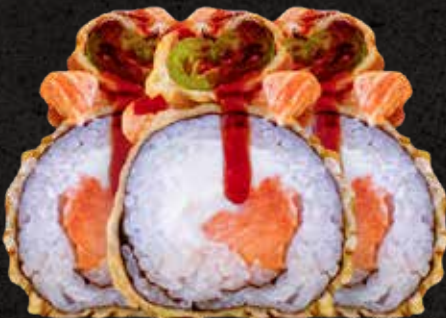
Tempura Sake Roll