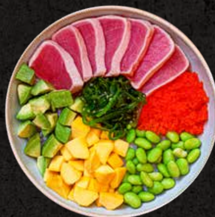
Seared Tuna Bowl 70g

Seared tuna served over a bed of rice with mango, avocado, edamame, seaweed salad, and masago.