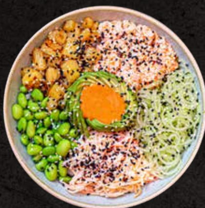
Kani Bowl 70g

Shredded kanikama and cucumber with edamame, tampico, and grilled pineapple over a bed of rice, finished with chipotle dressing and toasted sesame seeds.