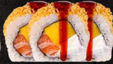
Roll 4 10 pieces

Delicious roll filled with salmon, mango and cream cheese. Topped with tempura flakes and finished with eel sauce.