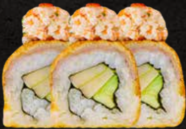
Roll 6 10 pieces

Delicious breaded roll filled with cream cheese and beef slices. Stuffed with Manchego cheese and avocado. Topped with spicy Tampico.