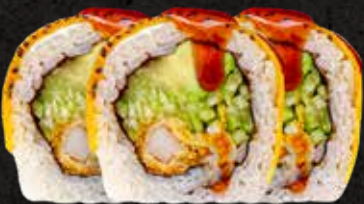
Roll 11 10 pieces

Delicious roll wrapped in cream cheese and fried plantain. Filled with breaded shrimp, cucumber and avocado. Finished with eel sauce.