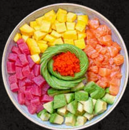
Shake & Tuna Bowl 140g

Fresh salmon and tuna cubes with mango, avocado, and masago over a bed of rice, drizzled with sweet and sour sauce.