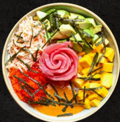
Tuna Bowl 70g

Kanikama salad with mango, avocado, masago, fresh tuna slices, and shredded nori, served over a bed of rice and topped with chipotle dressing.