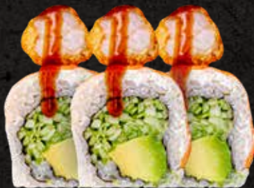
Roll 12 10 pieces

Delicious roll wrapped in cream cheese and fried plantain. Filled with breaded shrimp, cucumber and avocado. Finished with eel sauce.