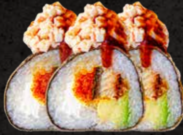
Roll 3 10 pieces

Delicious battered roll filled with avocado, eel, masago and cream cheese. Topped with tempura flakes and kanikama salad. Finished with eel sauce.