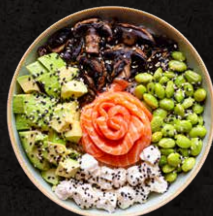
Shake Bowl 70g

Grilled mushrooms, edamame, avocado, cream cheese, fresh salmon slices, and sesame seeds served over a bed of rice, finished with habanero dressing.