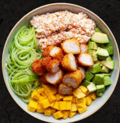
Ebi Bowl 50g

Crispy breaded shrimp, avocado, mango, cucumber strings, and tampico served over a bed of rice, accompanied by our signature Fuji sauce.