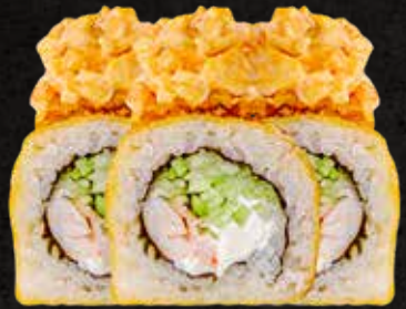
Roll 7 10 pieces

Delicious breaded roll filled with cucumber, cream cheese and shrimp. Topped with spicy seafood salad.