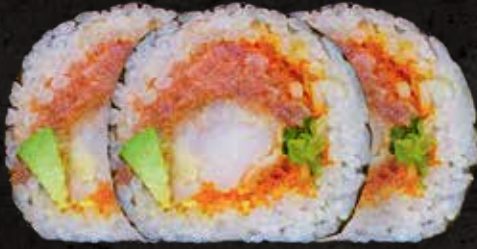
Spicy Tuna Roll