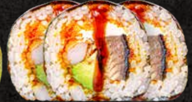
Roll 17 7 pieces

Delicious roll filled with breaded shrimp, cream cheese, avocado, masago and eel. Wrapped in seaweed and finished with eel sauce.