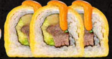
Roll 5 10 pieces

Delicious roll filled with skirt steak, avocado and Manchego cheese. Breaded with plantain and served with chipotle sauce.