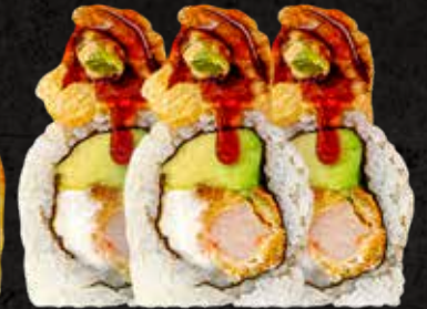
Roll 9 10 pieces

Delicious roll filled with breaded shrimp, cream cheese and avocado. Topped with battered vegetables, eel sauce and masago dressing.